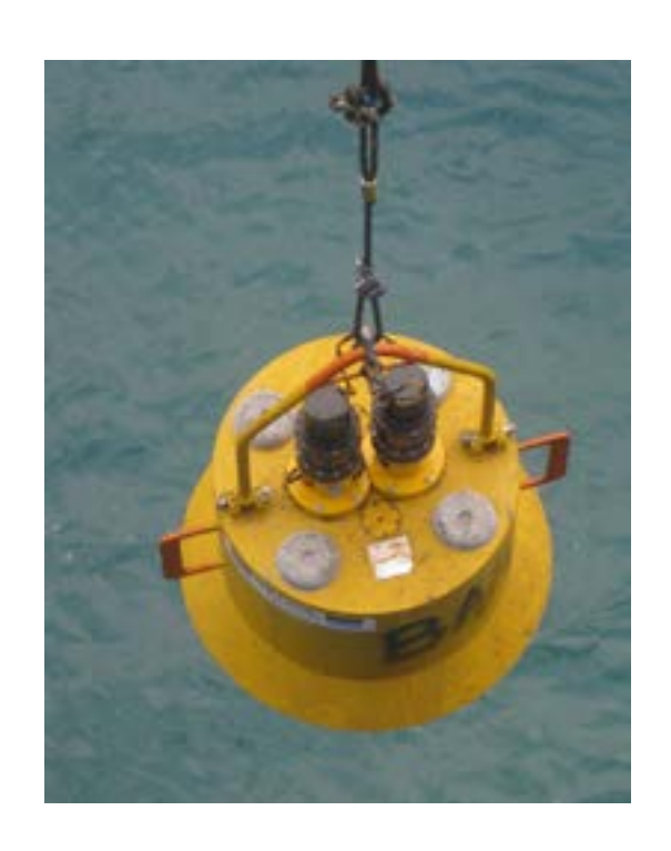
METROL Temporary Abandonment Cap