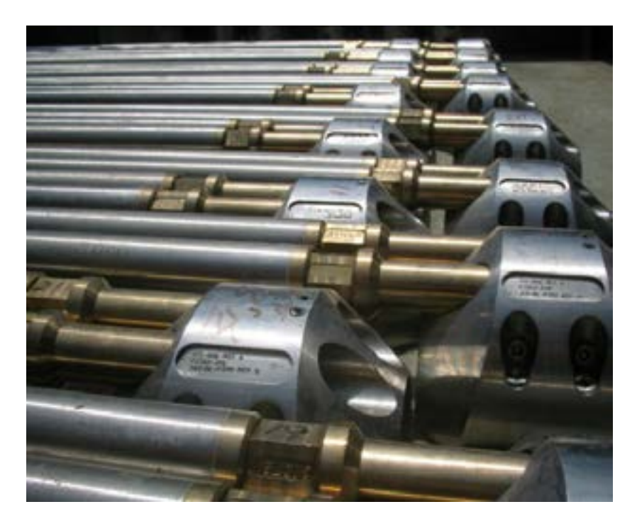
METROL Wireless Relay Stations